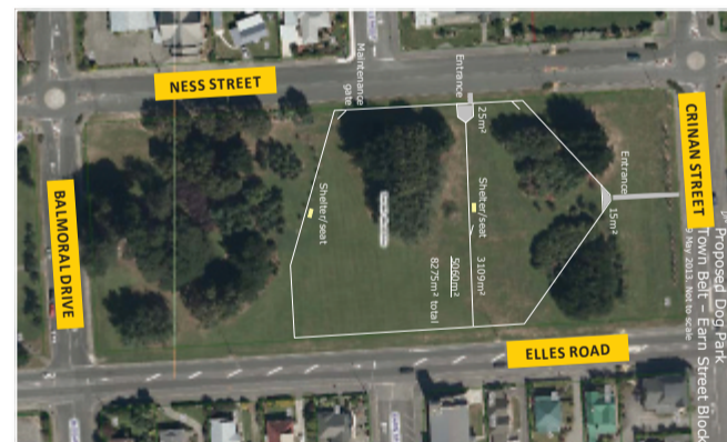
The outline of the dog park is shown by the white lines

We, and our canine friends, couldn't be happier!